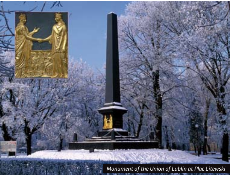
Monument of the Union of Lublin at Plac Litewski