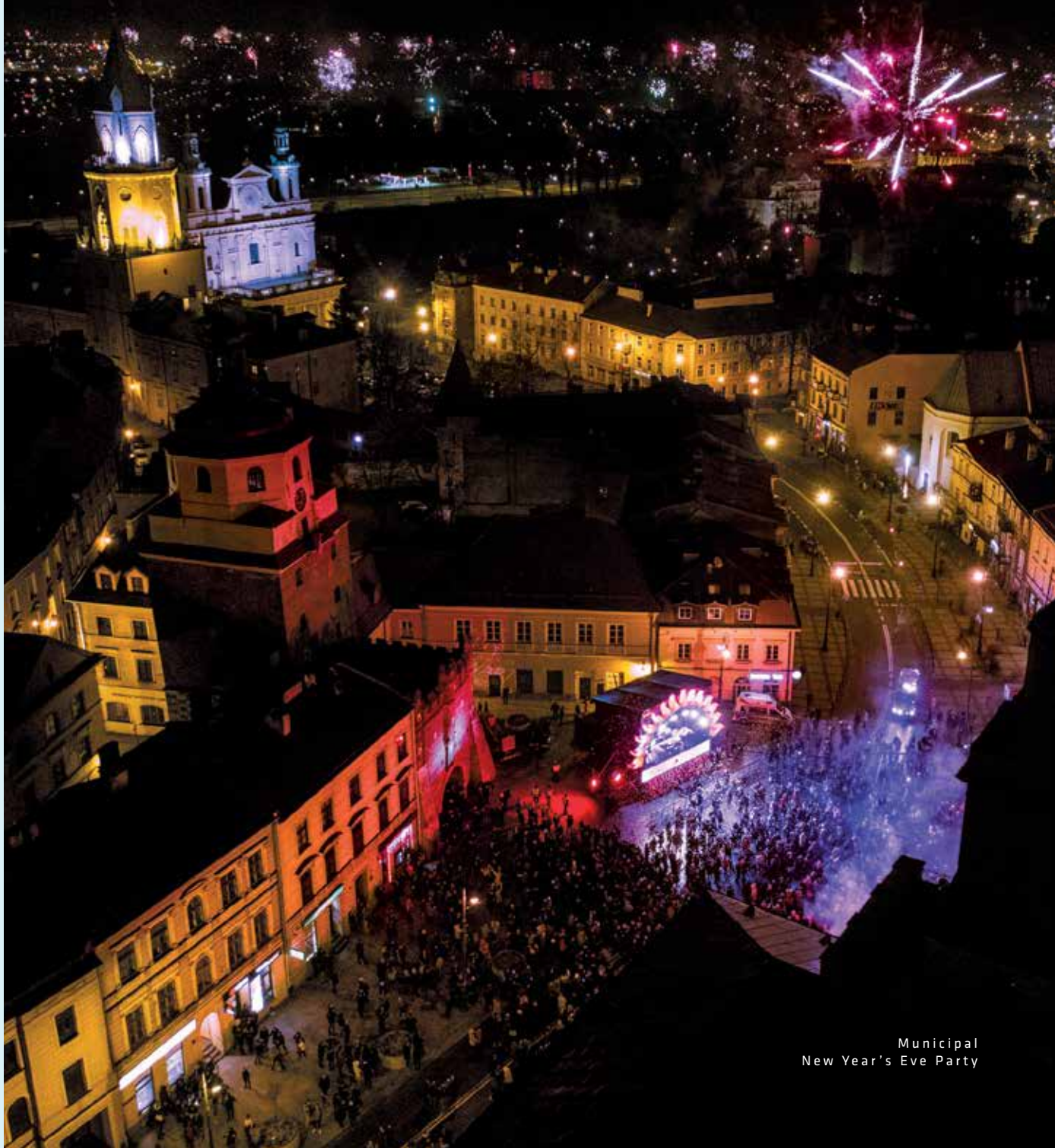
Municipal New Year's Eve Party