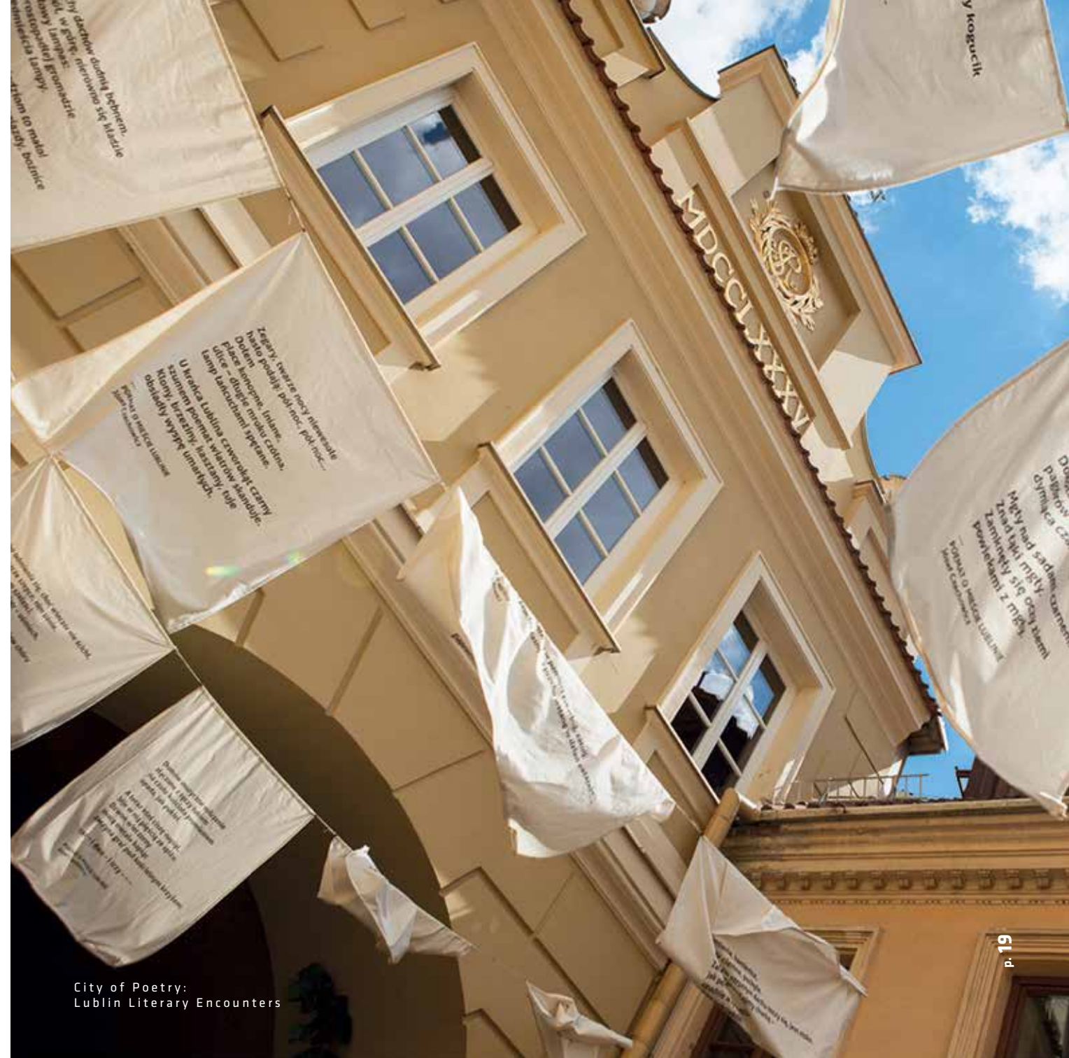
City of Poetry: Lublin Literary Encounters