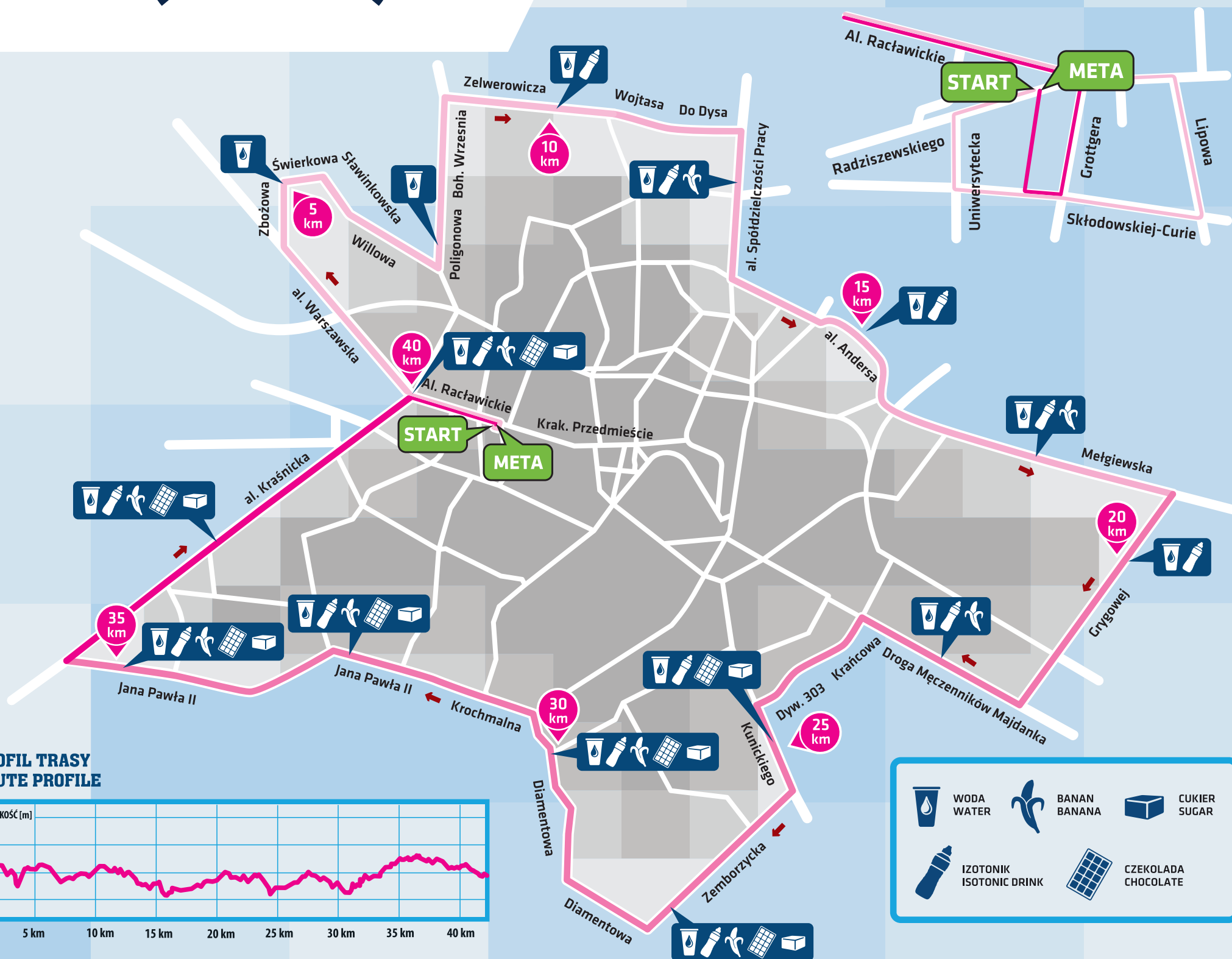
PROFIL TRASY ROUTE PROFILE