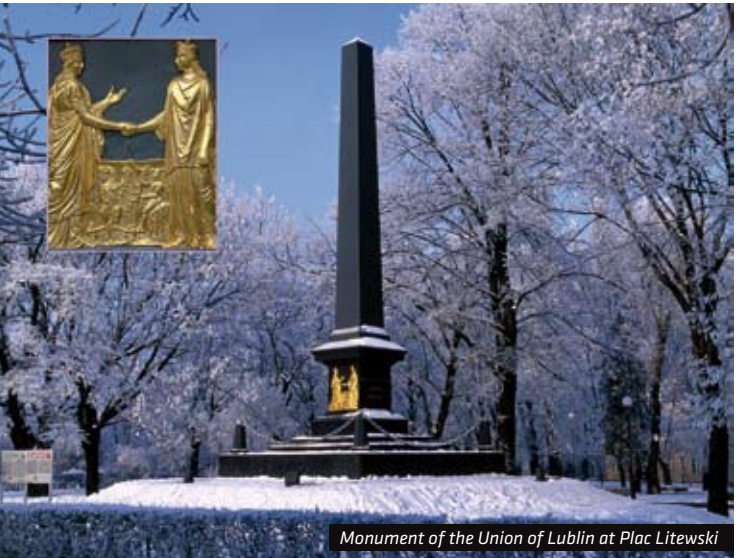
Monument of the Union of Lublin at Plac Litewski