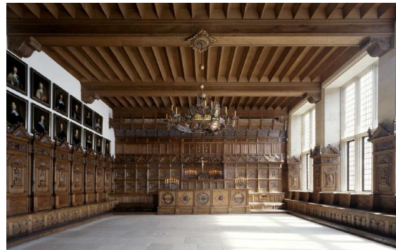
Town Hall of Münster

The two town halls of Münster and Osnabrück have planned a series of measures to further improve the communication of their European significance. Some of the planned activities build upon existing activities including youth and educational programs, and the use of artistic events to create synergies between history and contemporary creation. New multilingual products will be put in place, such as a brochure on “The Town Halls of the Peace of Westphalia”, a bibliography that will be made widely available, as well as training, exhibitions and public discussions. The submitted project meets the criteria for the European Heritage Label.