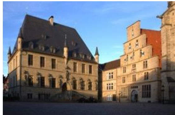
Town Hall of Osnabrück