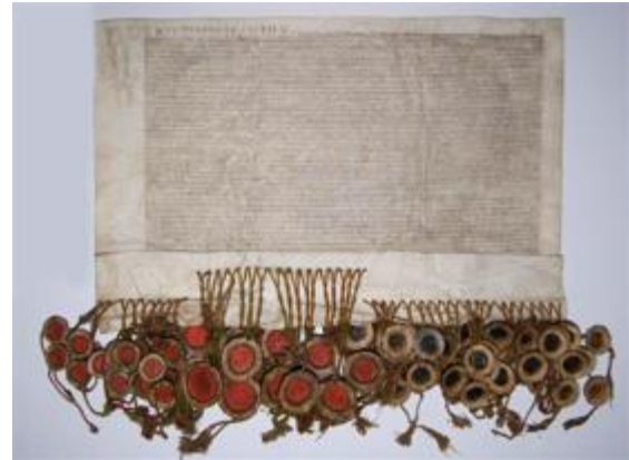
The Union of Lublin Act's copy – the original is stored at the States Archives in Lublin

The project has a clearly stated mission to build awareness of European integration in the 21st century by tracing links to the attainments of the Union of Lublin, and the subsequent experiences it fostered of religious toleration, and cultural diversity as well as democratic values. This is the starting point for a new branding strategy for the town alongside the promotion of joint projects focused on common memories of this multi-national community in the territory of the former commonwealth neighbours, including Belarus and Ukraine, as well as with Lithuania. The city will enhance existing initiatives, specifically its website, schools programme, "Union Day", with a media campaign, combined with the development of a new tourist trail with explicit emphasis on European integration, and the promotion of European values. The submitted project meets the criteria for the European Heritage Label.