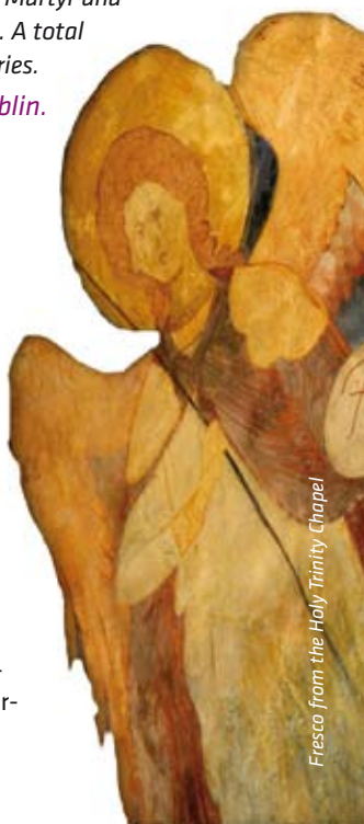
Fresco from the Holy Trinity Chapel

Austria; the Medieval seat of a guild in Tallinn, Estonia; two sites in the Netherlands: the Peace Palace in The Hague which houses the International Court of Justice and the Westerbork Nazi transit camp located in Hooghalen in the north of the country. In the 2014 selection, countries eligible for submitting proposals put forward a total of 36 candidatures to the European Commission. The European expert panel recommended awarding the Label to 16 candidates, and Poland is the only UE state to receive three nominations (the 3 May 1791 Constitution, the Historic Gdańsk Shipyard - sites related to the founding of the "Solidarność" movement, the Union of Lublin).