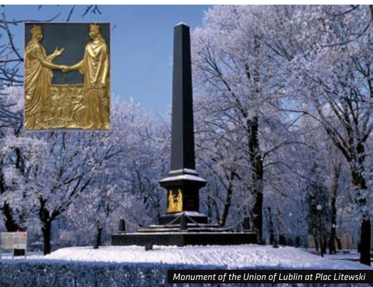
Monument of the Union of Lublin at Plac Litewski