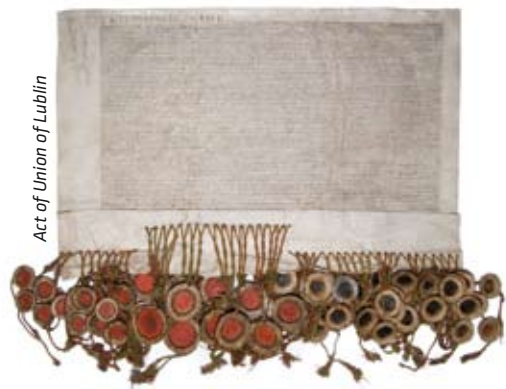
Act of Union of Lublin

The goal of the European Heritage Label is not to protect sites but rather to promote their European dimension, making them accessible to as many recipients as possible, the young ones in particular, as well as providing high-quality information and organising educational and cultural activities to emphasise the role and the place of a given site in the history of Europe and the European integration. The European Heritage Label may also bring about economic benefits through supporting cultural tourism.