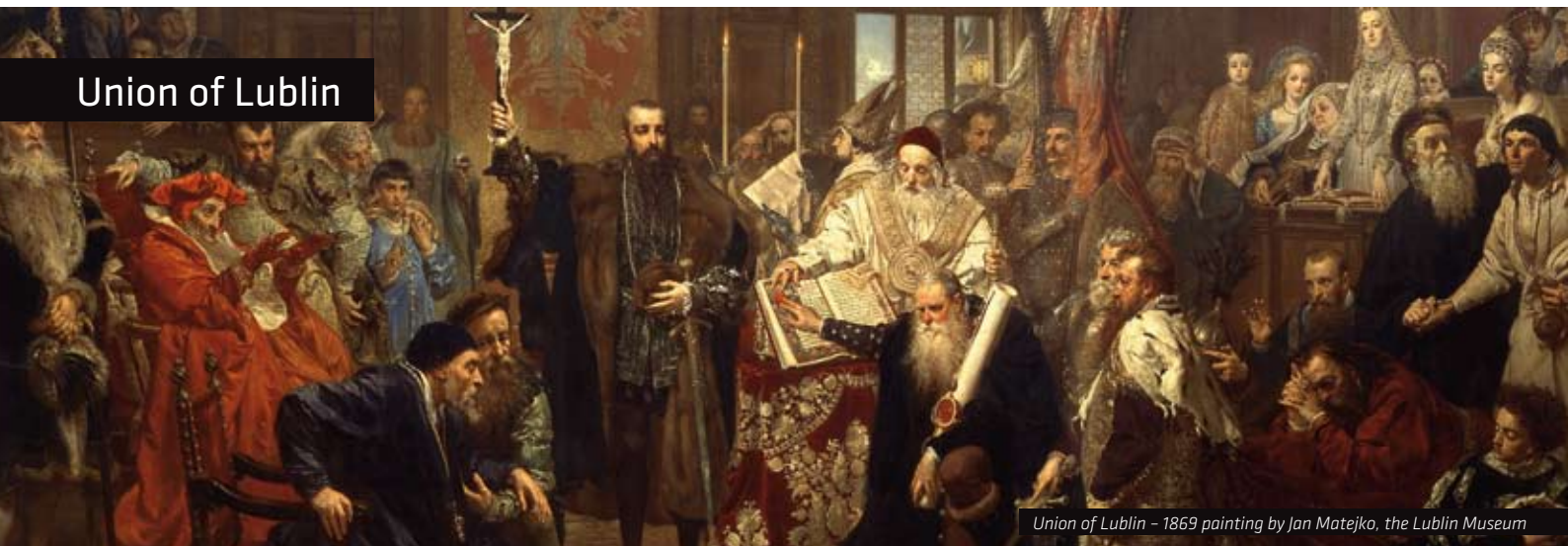
Union of Lublin - 1869 painting by Jan Matejko, the Lublin Museum