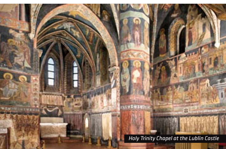
Holy Trinity Chapel at the Lublin Castle