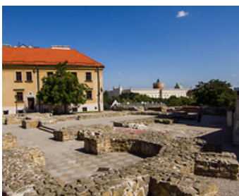
Old Parish Square