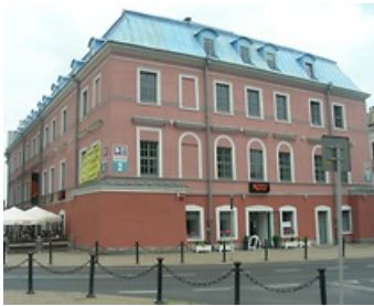
The Palace of the Parys Family