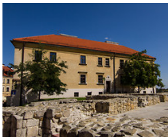
The Old Vicarage