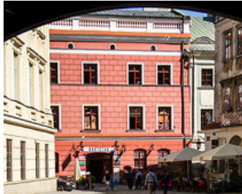
Lubomelski's Tenement House