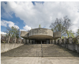
New Jewish Cemetery