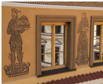
Tenement House at ul. Rynek 20