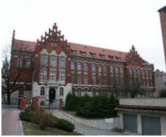
August & Juliusz Vetter Economic Schools of Lublin