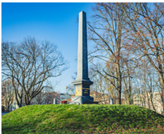
The Union of Lublin Monument