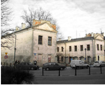
The former Palace of the Potocki Family