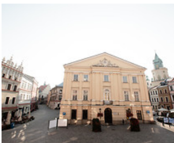
Old Town Market