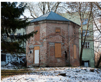
The Former Gallows