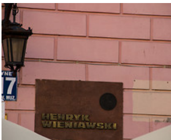
Wieniawski's Tenement House