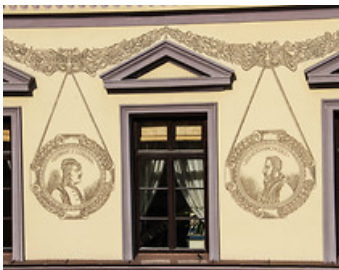
Klonowic's Tenement House