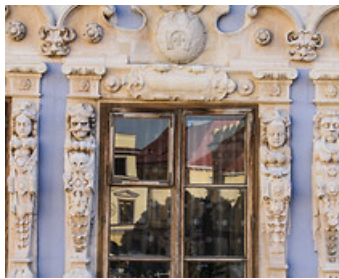
Konopnic's Tenement House