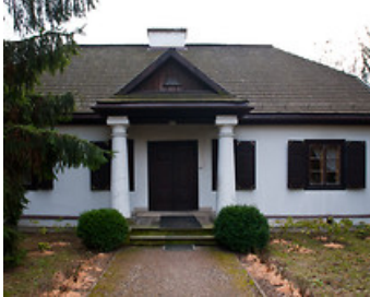
The Manor of Wincenty Pol