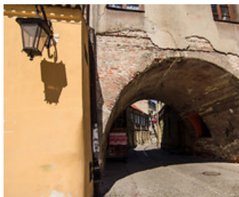
Fish Market Gate