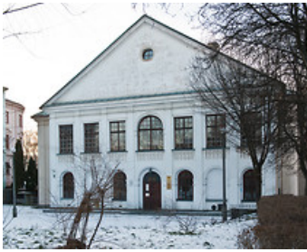
The Princes Czartoryski Palace