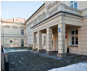
The Palace of the Morski Family