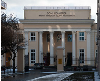
The Soldier's House