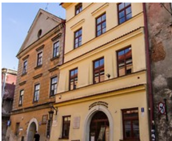
Tenement House at 3 Złota Street