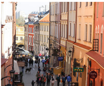
The Old Town