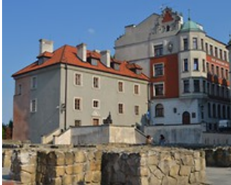
The Old Mansionary (Vicars' House)