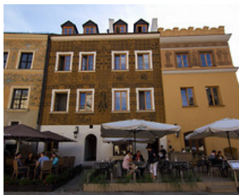
Tenement House at ul. Rynek 19