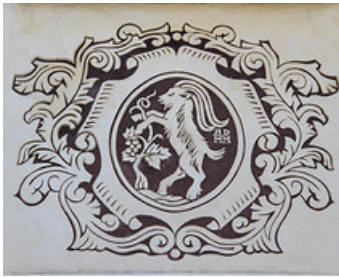
Small Town Hall