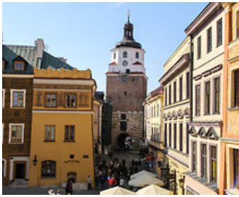
The Krakowska Gate (The Cracow Gate) - Museum of History of the city of Lublin