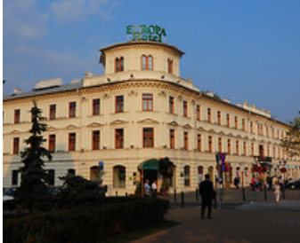
The Europa Hotel