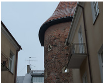
The Gothic Tower (The Semi-circular Tower)