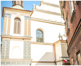
The Basilica of the Dominican Order of St. Stanislaus the Bishop and Martyr