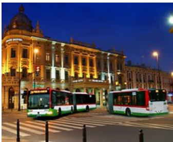
The Lublinianka Hotel - old building of the Lublin Industrialists' Fund