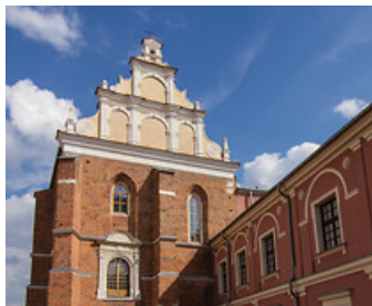
The Holy Trinity Chapel