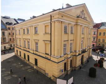
Crown Tribunal (Old Town Hall)