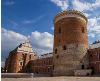
The Castle Tower (Donjon)