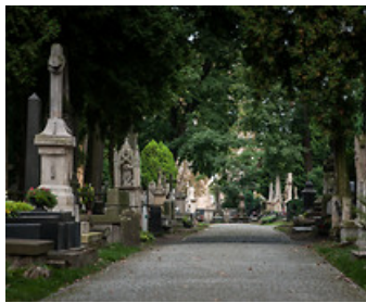
Cemetery at ul. Lipowa