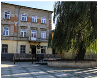
Fish Market Square