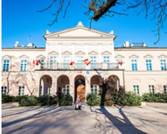
The Palace of the Lubomirski Family