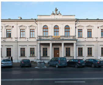
The Edifice of the Land Credit Society