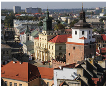
The New City Hall