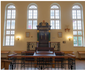
The Old University of Wise Men of Lublin (Jesziwas Chachmej Lublin)