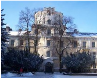
The former Palace of the Sobieski Family