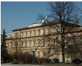
The building of the former Government of Governorate